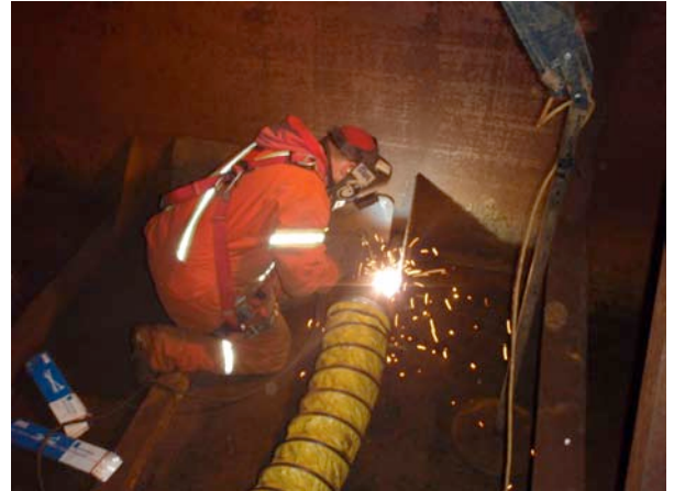
Hull Repairs – Confined Space Entry